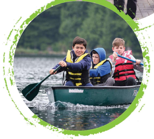
PICTURED FROM TOP: Catholic Youth Convention, Seminarians, CYO Camp