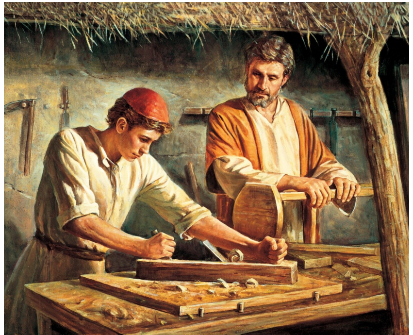
Feast of St. Joseph the Worker - May 1st