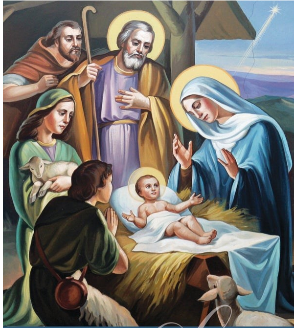
The Nativity of the Lord