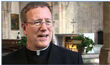
A DVD series w/Bishop Robert Barron

Eight Monday sessions beginning October 12th going through November 23rd at 9:45am and 6:00 pm in St Augustine CR2,