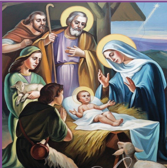
The Nativity of the Lord