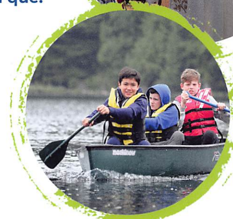
IMÁGENES DESDE ARRIBA: Capacitación en prevención del suicidio. Convención Católica de Jóvenes, CYO Camp