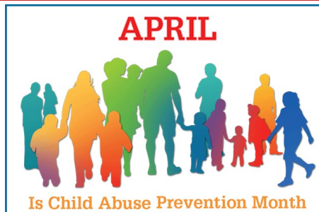
Is Child Abuse Prevention Month

Throughout the month of April, we join the nationwide effort to increase awareness about child abuse and abuse prevention. National Child Abuse Prevention Month is a great opportunity to pray for the eradication of child abuse and for the protection of all children. For more information go to: